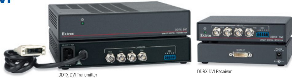
DDTX DVI Transmitter