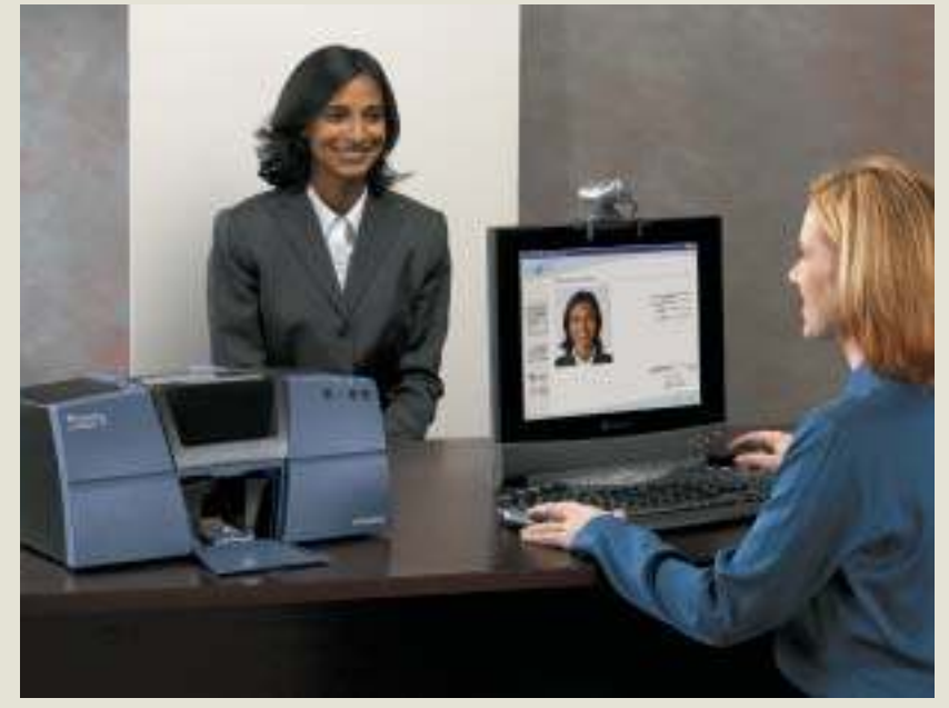
Every FARGO Persona Desktop Card Printer is easy to set up, easy to use, and easy to maintain. Their smooth, reliable operation means, whether you print one card per day or hundreds, you'll get consistently great-looking cards at an economical price.