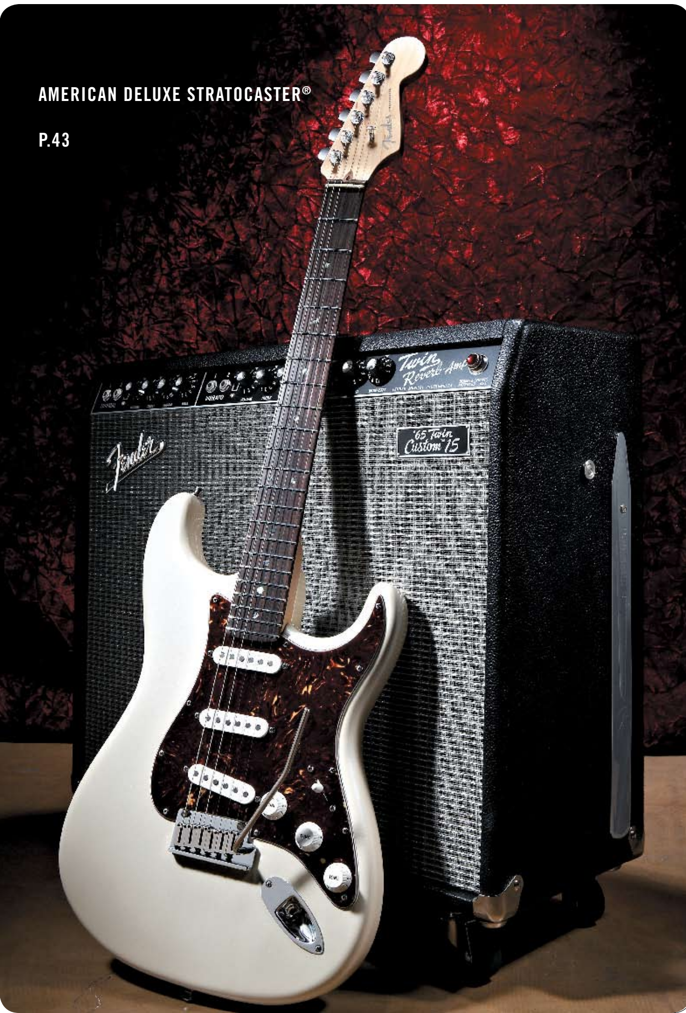
Download from Www.Somanuals.com. All Manuals Search And Download.