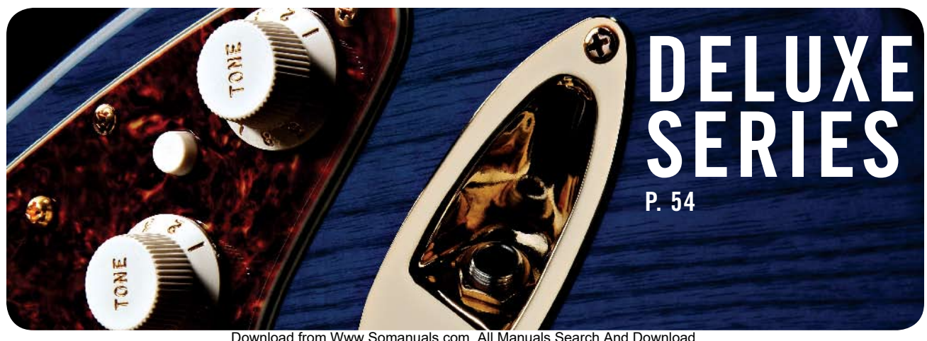
Download from Www.Somanuals.com. All Manuals Search And Download.