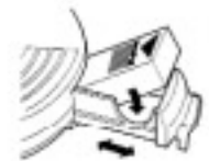
Installing the SensorPack® Module