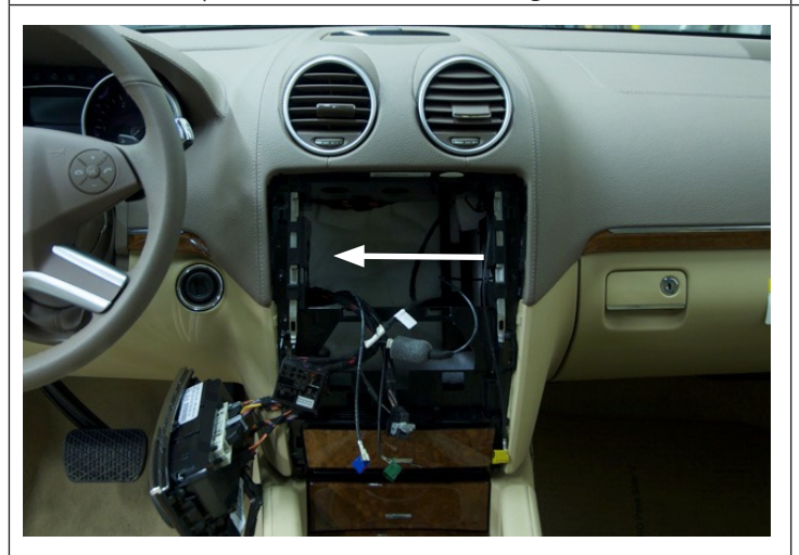
7) Access EIS wiring through opening