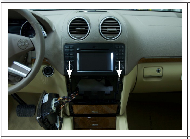
5) Pull down on retaining bars