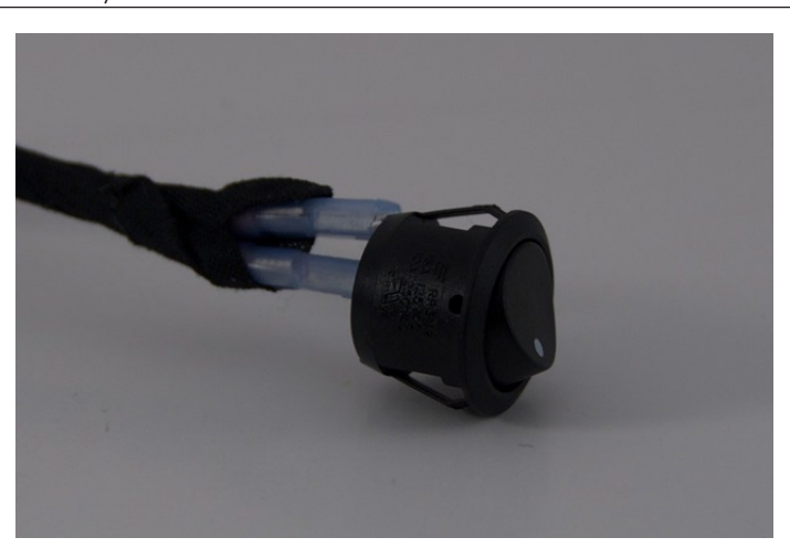
8) Make sure the valet switch is off