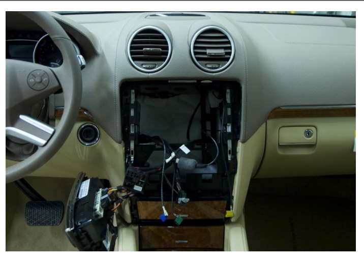
6) Remove and disconnect COMAND unit