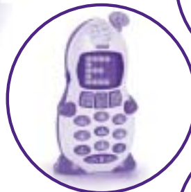
Learning Phone™ C6324