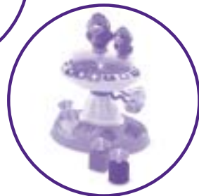
Learning Birdbath™ C6513

For countries outside the United States: