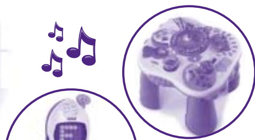
Learning Table™ C5522