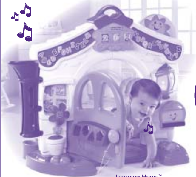
Learning Home™ C6327

Collect all these Laugh & Learn™ toys. Each has a special place in the Learning Home!