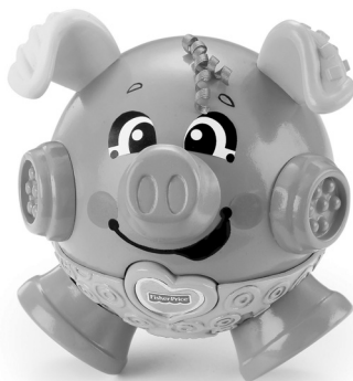
Bounce and Giggle™ Pig G6684