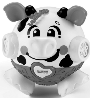
Bounce and Giggle™ Cow G8370

Please keep this instruction sheet for future reference, as it contains important information.