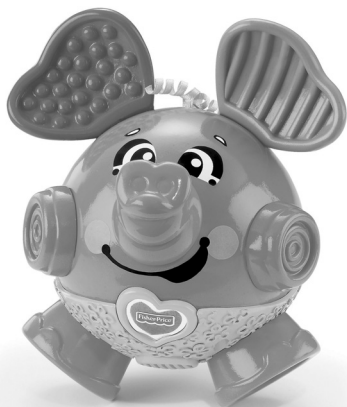
Bounce and Giggle™ Elephant G6683