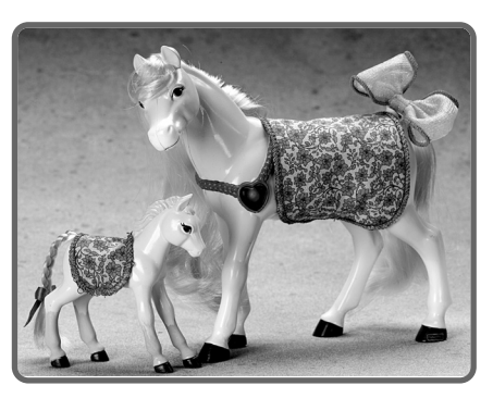
Powder & Baby Precious 75394