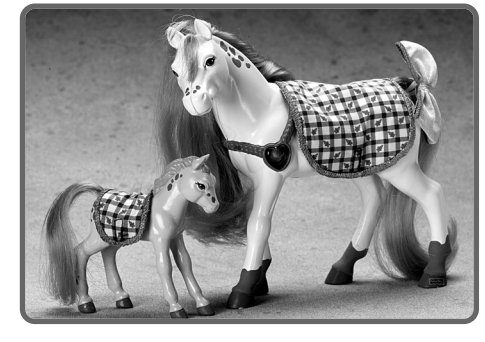
Summer & Baby Sky 75396

Product features and decorations may vary from the pictures above.