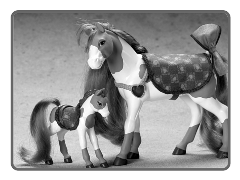
Misty & Baby Meadow 75395