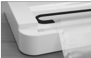
Place Bag in Vacuum Channel