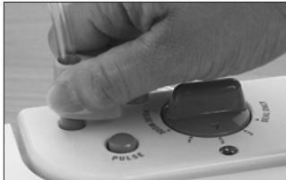
Insert Accessory Hose