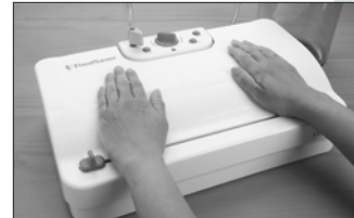
Press and Release Lid