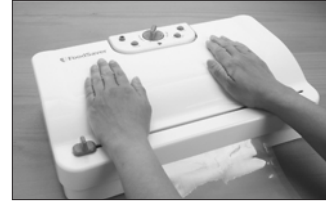
Press and Release Lid