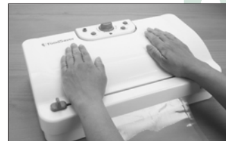
Press and Release Lid