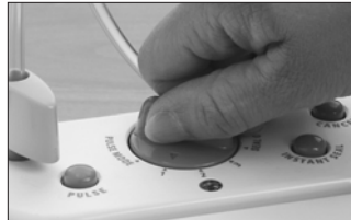
Set Seal Control Switch