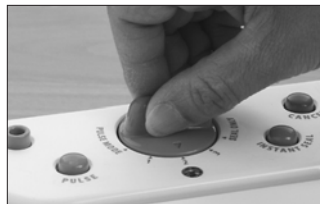
Set Seal Control Switch