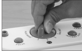
Set Seal Control Switch