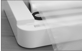
Pull Out Bag Material