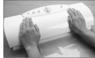
Press and Release Lid