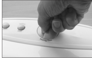
Set Seal Control Switch