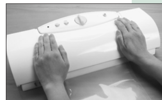
Press and Release Lid