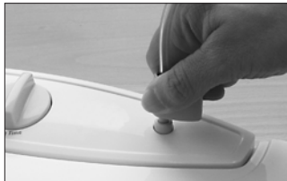
Insert Accessory Hose