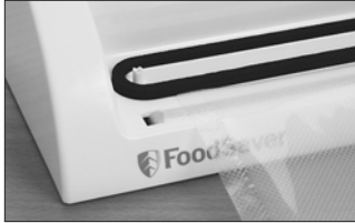
Place Bag on Sealing Strip