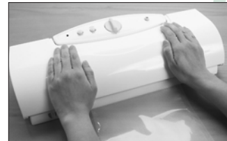
Press and Release Lid