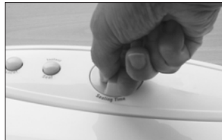
Set Seal Control Switch