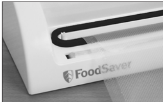
Place Bag in Vacuum Channel