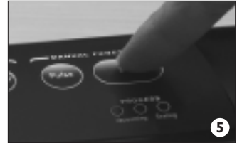
Press Seal Button