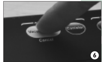
Press Vacuum & Seal Button