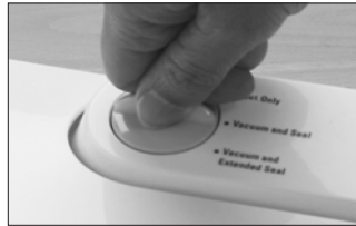
Set Seal Control Switch