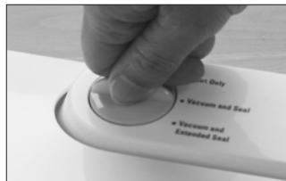
Set Seal Control Switch