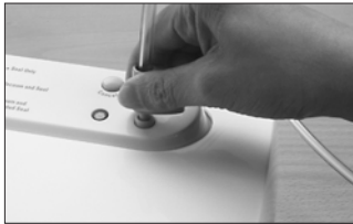
Insert Accessory Hose