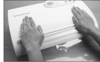
Press and Release Lid