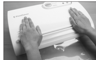
Press and Release Lid