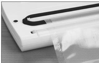
Place Bag in Vacuum Channel