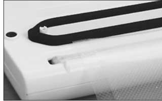
Place Bag on Sealing Strip