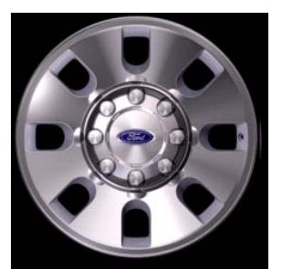
18" Premium Forged Aluminum (Lariat) (Standard) (644)