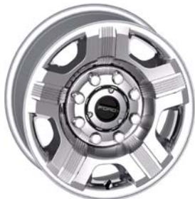
18" Premium Chrome-Clad Steel (FX4) (Standard) (64R)