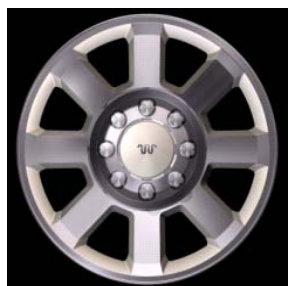
20" Painted Polished Forged Aluminum (Optional on King Ranch) (643)