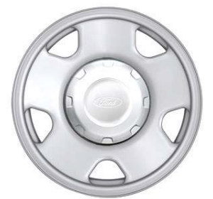
17" Argent Painted Steel (XL) (Standard) (64A)