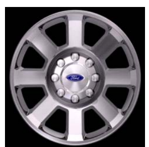
20" Premium Polished Forged Aluminum (XLT, FX4, Lariat) (Optional) (642)