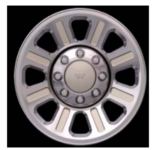
18" Painted Aluminum (Standard on King Ranch)