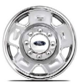
17" Chrome-Clad Steel (XLT) (Standard) (64C)