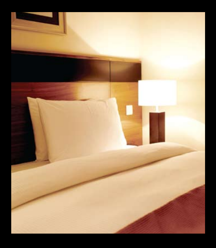
VERT-I-PAK® VERTICAL SINGLE PACKAGE AIR CONDITIONERS ELECTRIC HEAT | HEAT PUMP