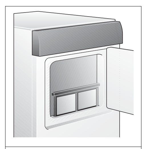
Clean lint screen after every load.

A WARNING To reduce risk of fire or serious injury to persons or property, comply with the basic warnings listed in Important Safety Instructions and those listed below.