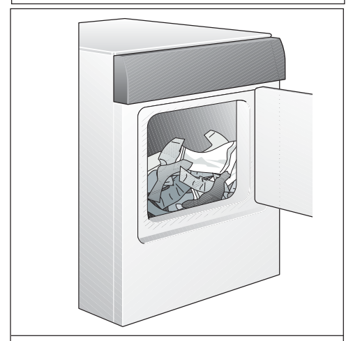
Fill dryer drum 1/3 to 1/2 full.