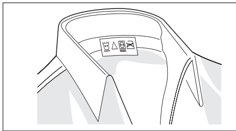
Follow fabric care label instructions.