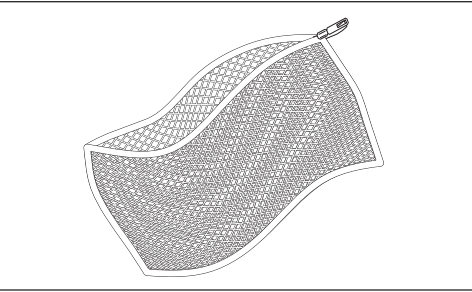
Place small items in a mesh bag.