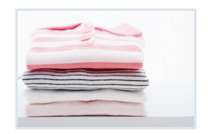
DrySense™ Technology Dries your clothes more precisely, reducing wrinkles.