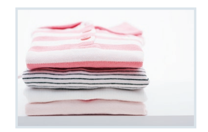
DrySense™ Technology Dries your clothes more precisely, reducing wrinkles.