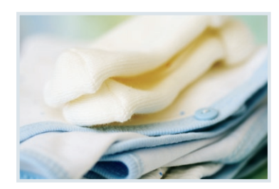
WashSense™ Technology Our WashSense™ technology ensures clothes get clean with care.