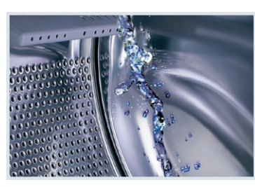
Advanced Rinse Technology Final rinse uses fresh water to ensure whiter whites and reduce allergens.