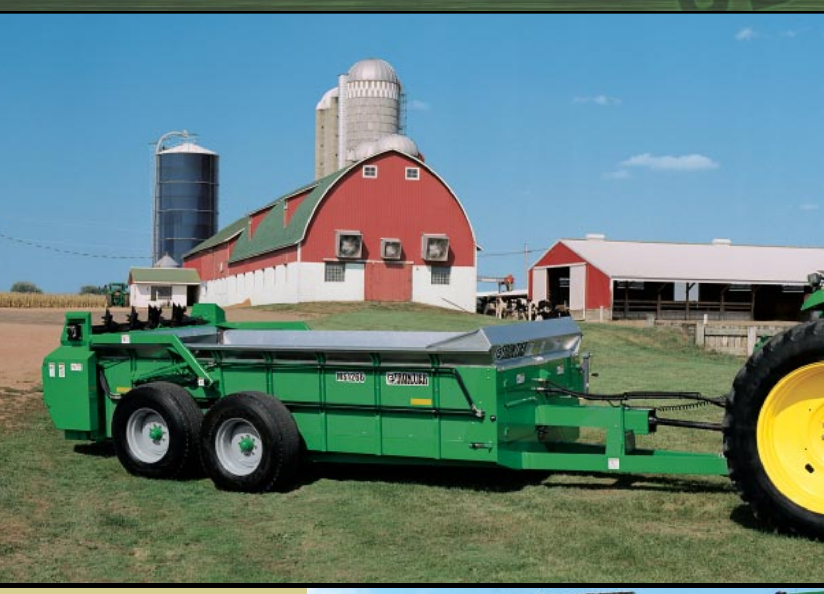
Heavy-duty spreaders from 235- to 660-bushel capacity to fit your operation

Hydraulic endgate – ideal for high-moisture loads. Standard on 310- to 660-bushel spreaders