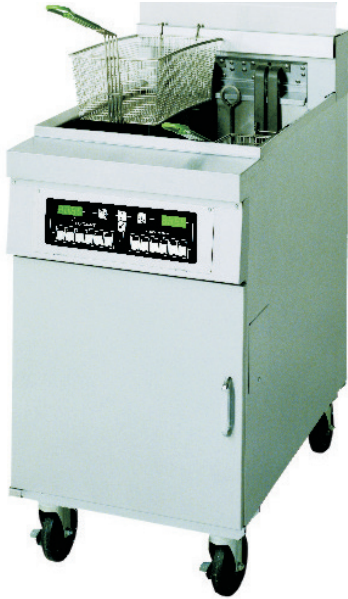
Shown with optional computer and casters