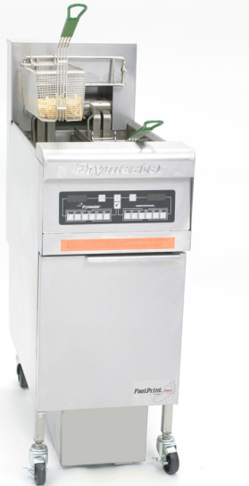
FPRE14 Shown with optional computer .