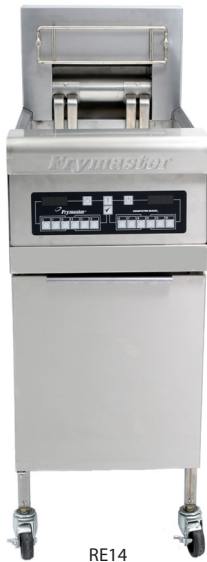
RE14 Shown with optional computer and casters