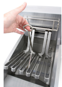
Combines swing-up elements with controlled burn-off cleaning (RE14 illustrated). Lift handle not available on 22 kW split pot element assembly.

8700 Line Avenue Shreveport, LA 71106-6800 USA