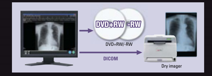
Image data stored on the PC HDD can be automatically backed up on DVD with high image quality. Film outputs of DICOM files are made with a connectable Dry Imager.