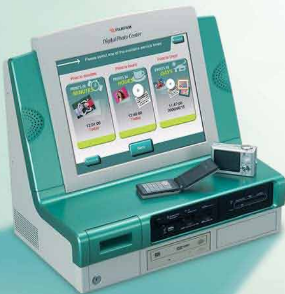
Digital Photo Center print ordering terminal

Amidst steadily growing demand for digital camera prints, the ability to provide digital camera printing services is an effective way to expand business. Now Fujifilm offers a simple digital camera print system that can be installed with minimal investment. Combining print ordering terminals and a thermal photo printer, the innovative Fujifilm Thermal Photo Printer System is the affordable way to introduce digital print services.