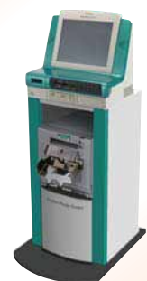
Design of stands may vary according to the country or region.

The Digital Photo Center and the Thermal Photo Printer both feature compact space-saving designs, allowing you to offer digital camera print services even in a limited space. Special stands accommodate multiple printers, creating smart-looking installations that can handle large numbers of orders.