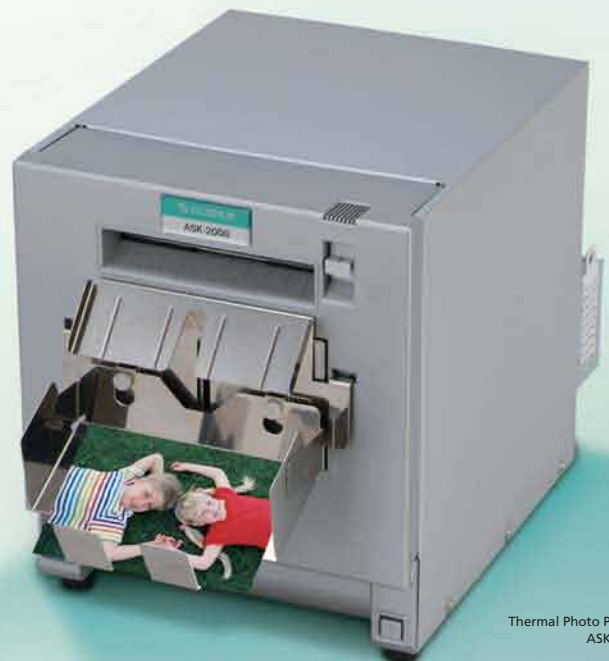
Thermal Photo Printer ASK-2000