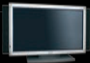
P50 XTA 51ES

The Plasmavision™ P50 XTA 51ES is part of Fujitsu's latest line of high definition Plasmavision™ monitors, bringing the ultimate viewing experience into your living-room.