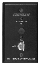
RS-1 and RS-2 Remote System Control Panels