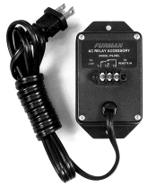
PS-REL AC Relay