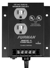
MiniPort Power Relays. 15A, 20A, 30A

The PS-8R, along with other Furman AC power accessories, can be an integral part of a complete AC power control system. Visit our website or contact us— we'll send you our "AC Power System Application Suggestions" brochure, and Furman's new color catalog.