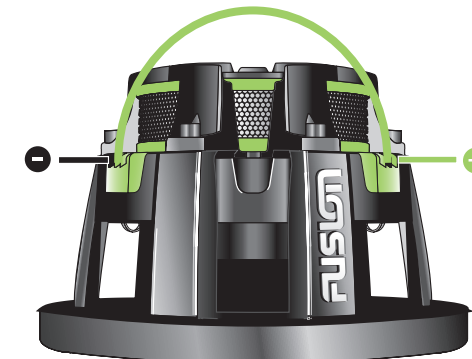
4 ohm operation

To wire a 2 x 2 ohm DVC subwoofer in series (to get 4 ohms), use one short piece of speaker wire and link the positive from one voice coil to the negative of the second coil as shown below. Then wire the amplifier to opposite sides of the subwoofer.