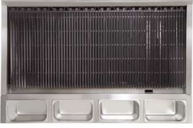
Up to 130° temperature variation across the entire surface

Garland has made the HE Broiler so easy to use that starting or stopping the broiler is as easy as flipping a switch. The switch automatically starts the sparking sequence and opens the gas valve allowing the unit to fire up almost instantly. Further, the broiler is divided into zones (each with individual controls) to provide flexibility and assist in energy savings.