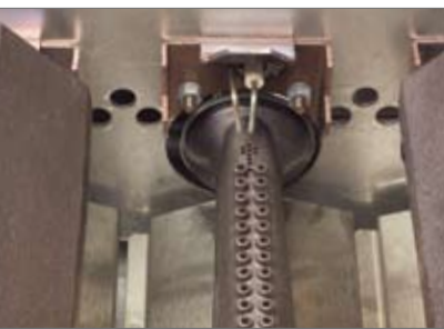
Continuous sparking ignition keeps the flame alive