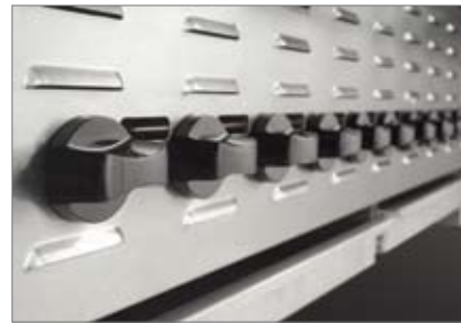
High-Low controls for each section for the perfect set-up

Convenient High low valves allow you to configure your broiler perfectly for your menu. Once set, no adjustment is necessary. Simply use the Quick Switch to start the unit. Training is kept to a minimum.