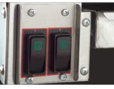
A simple flip of the Quick-Switch is all it takes to fire the unit up