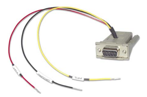
FIGURE 4. RJ45 to DB9 Serial Adapter, Part Number 17218