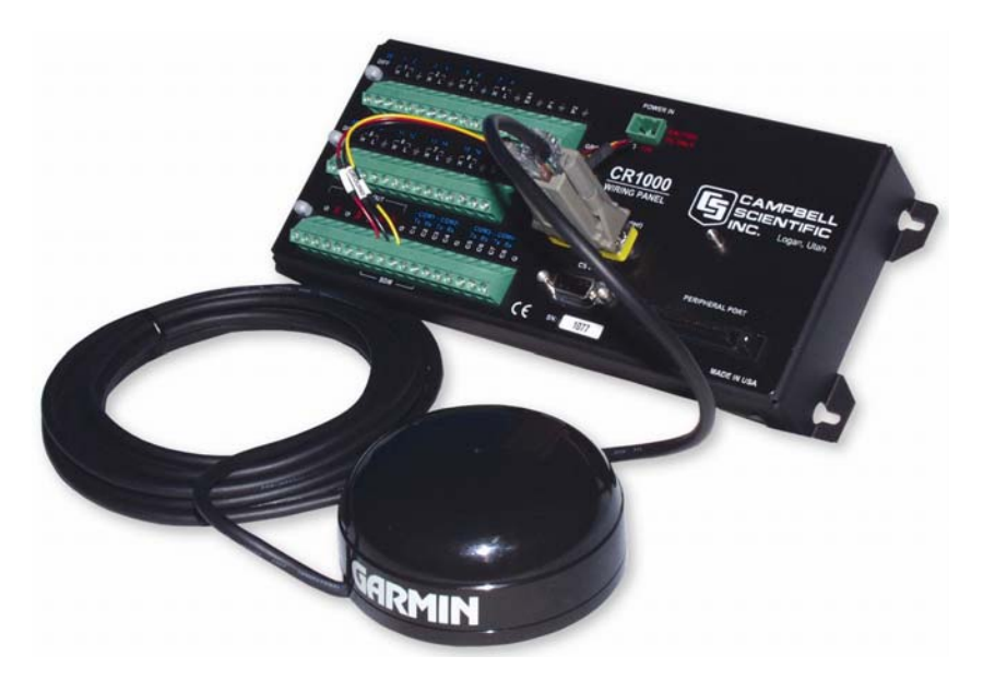
FIGURE 3. CR1000 to GPS16-HVS Using the 17218 Adapter