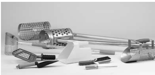
Figure 10, Various commercially available recovery tools

A trowel is best for recovering items in clay or gravel areas.