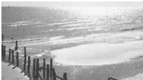
Figure 7, Surf Pattern

Study surf and weather patterns - Pay attention to storm, wind and tide activity. Treasures from deepwater vaults are often transferred to shallower locations like tidal pools and water-filled depressions near the shoreline. A beach considered unproductive can suddenly yield riches. Heavy storm waves often unearth treasures like rings caught in exposed rock and gravel areas. (Figure 7).