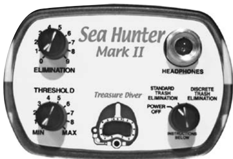
Figure 1, Panel Face

Power - Use to turn the detector on and choose either of two search modes. A battery check occurs automatically each time the power is switched on. (Figure 1)