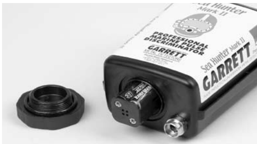
Figure 8, Proper battery pack re-installation

To access the battery pack, unscrew the battery cap at the rear of the detector housing, by hand. Do not use tools. The o-ring should remain in the control housing while the battery pack slides out. When installing batteries ensure that they are aligned with the correct polarity (plus and minus) markings. Re-install the battery pack by placing the contact end of the housing inside first and pointing downward (figure 8). Verify that the o-ring is well-lubricated and free from debris. Add a little silicon grease or petroleum