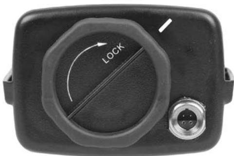
Figure 9, Proper battery cap re-installation

jelly, if necessary. Reinstall the battery cap, hand tighten it until it is flush with the housing and the two index marks are aligned as shown (Figure 9).