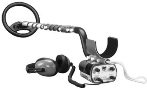
Figure 4, Full length with undercuff