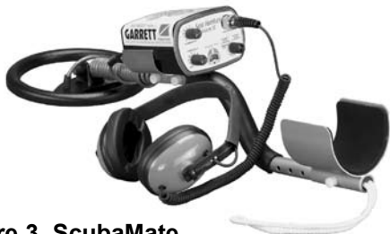
Figure 3, ScubaMate

1. Choose a desired operating / stem / control housing configuration. Assemble the stem and attach the control housing as desired. (Figure 3,4,5).