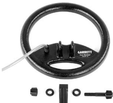
Figure 6, Parts needed to assemble stem and searchcoil

2. Attach the searchcoil to the lower stem. Align the mounting holes of the searchcoil and stem, insert the threaded bolt through the holes and hand-tighten the knobs; Do Not use tools. (Figure 6)