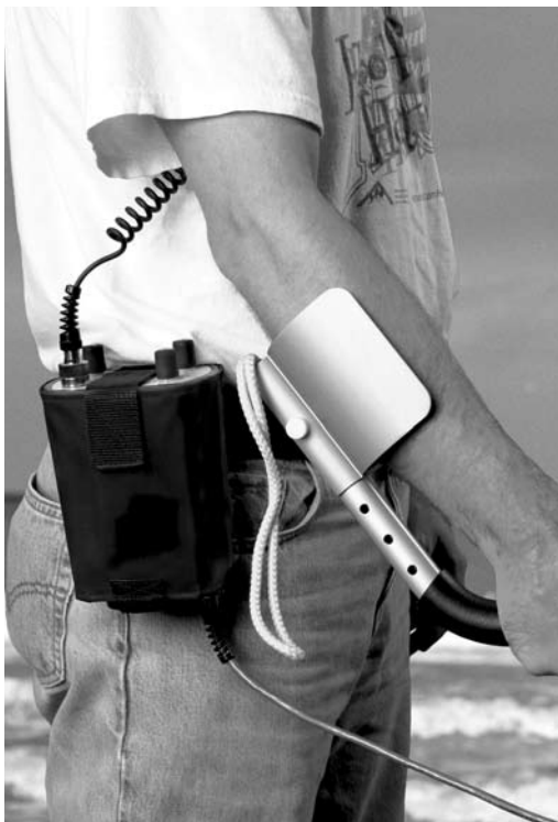
Figure 5, Long stem with hip mount configurations