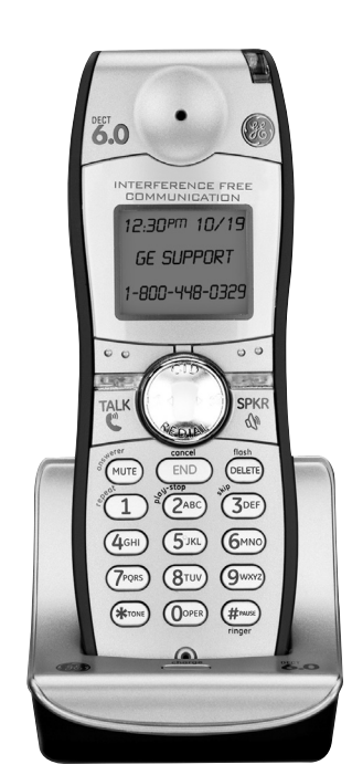
for use with Systems 28122, 28128, and 28132 Series