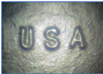
Bright illumination even on black castings