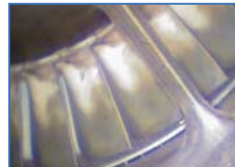
LPT blades in a turbine engine