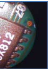
Printed circuit board