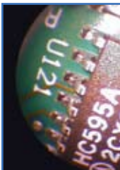
Components on a printed circuit board