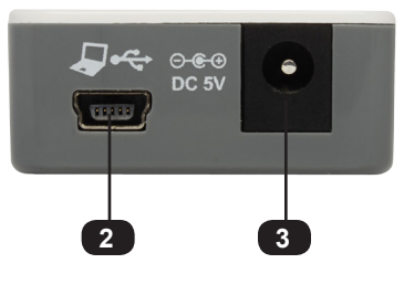
page | 2