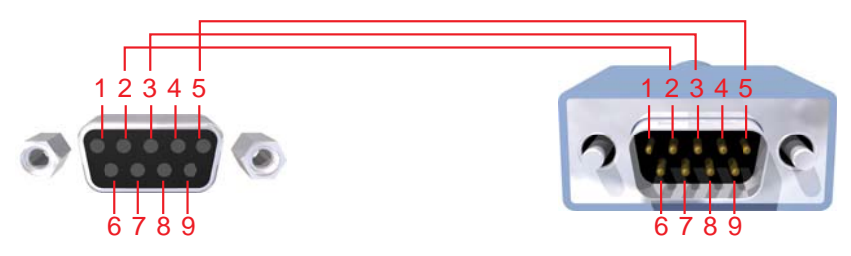
Only Pins 2 (RX), 3 (TX), and 5 (Ground) are used on the RS-232 serial interface