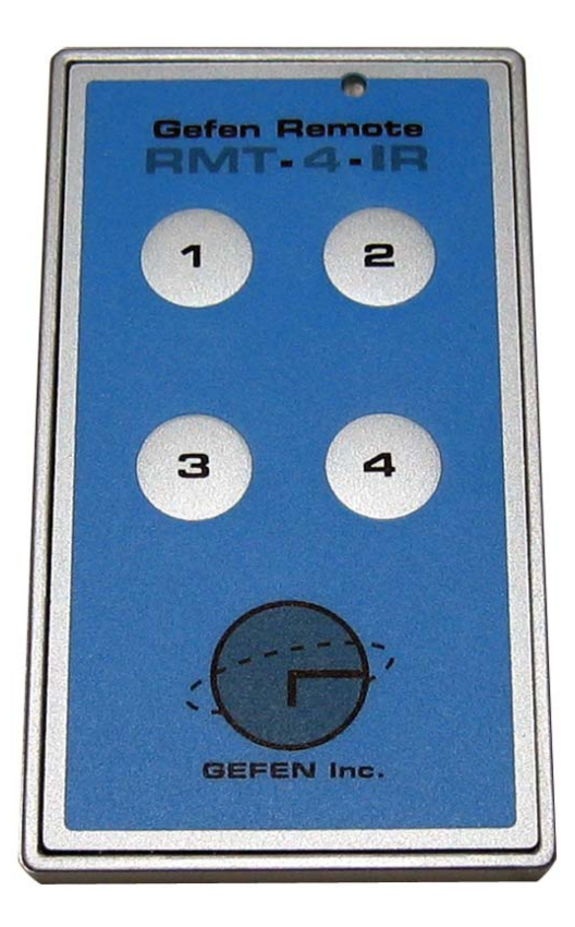
Download from Www.Somanuals.com. All Manuals Search And Download.

Note: The RMT4-IR ships with two batteries. One battery is required for operation, the second battery is complimentary.