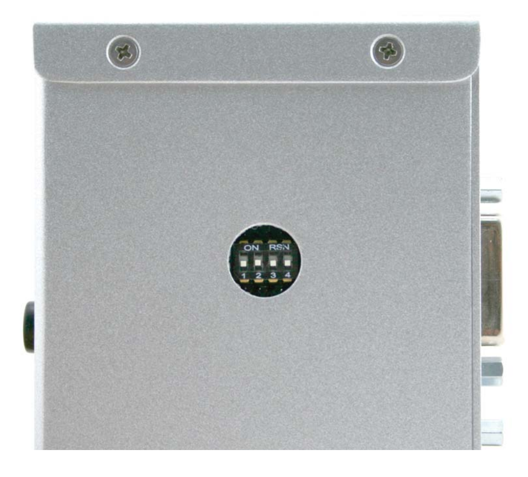
Download from Www.Somanuals.com. All Manuals Search And Download.