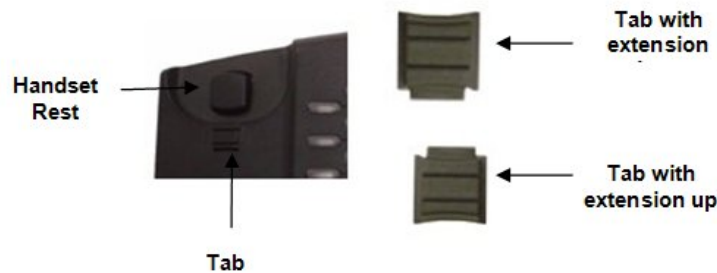
Figure 4: Placing tab for mounting phone to wall