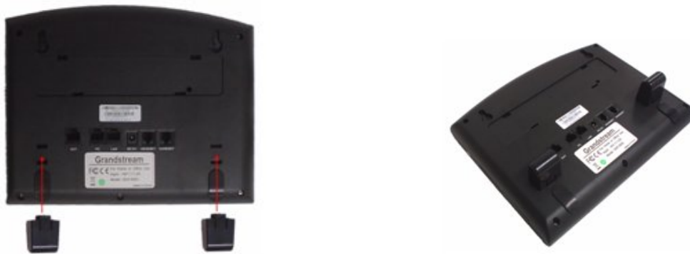
Figure 2: Attach the wall mount spacers to the GXP2020

To position the phone on the wall, place two fixed hangers on the wall, hang the back of the phone on the fixed hangers.