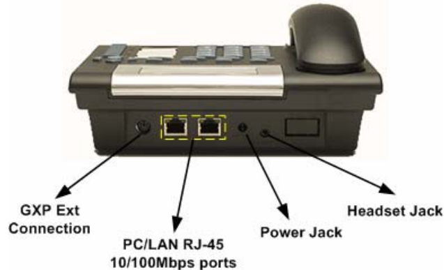
Figure 1: Connectors on the back of the GXP2000