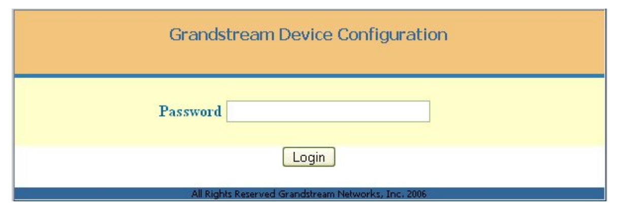
FIGURE 3: SCREENSHOT OF CONFIGURATION LOG- IN PAGE

NOTE: If you cannot log into the configuration page by using default password, please check with the VoIP service provider. The service provider may have provisioned and configured the device for you. The Basic Configuration Page is the first web GUI the user will see.