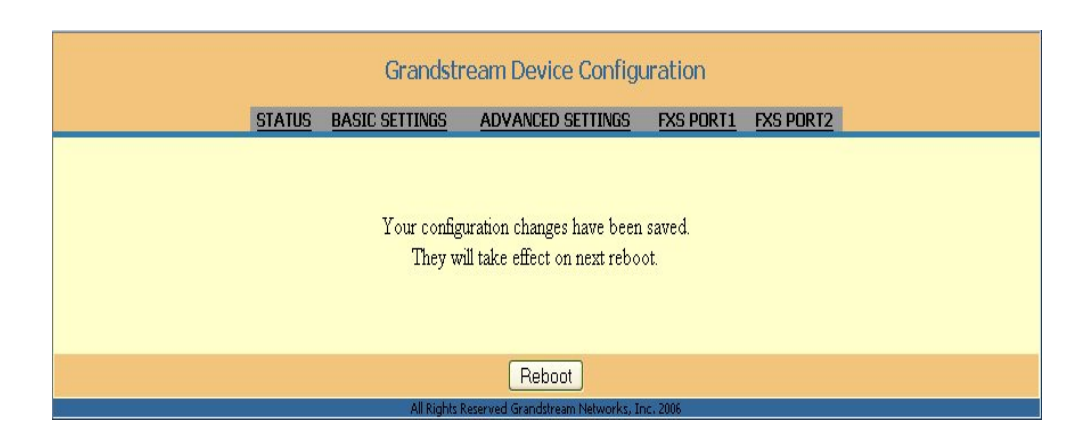
FIGURE 5: SCREENSHOT OF SAVE CONFIGURATION PAGE

After making a change, click the "Update" button in the Configuration page. The HT–496 will display the following screen to confirming changes. Reboot or power cycle the HT–496 to enable the changes.