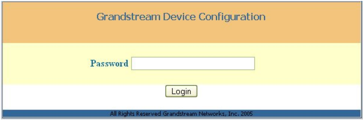
FIGURE 4: SCREENSHOT OF ADVANCED USER CONFIGURATION LOG- IN PAGE

Each FXS SIP account has its own configuration page. Their configurations are identical.