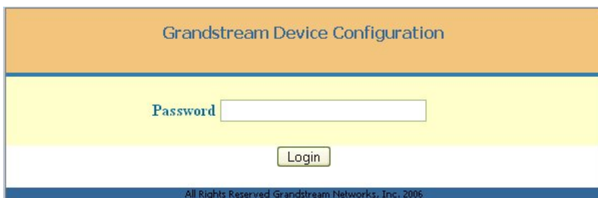
FIGURE 3: SCREENSHOT OF CONFIGURATION LOG IN PAGE

NOTE: If you cannot log into the configuration page by using default password, please check with the VoIP service provider. The service provider may have provisioned and configured the device for you. The Basic Configuration Page is the first web GUI the user will see.