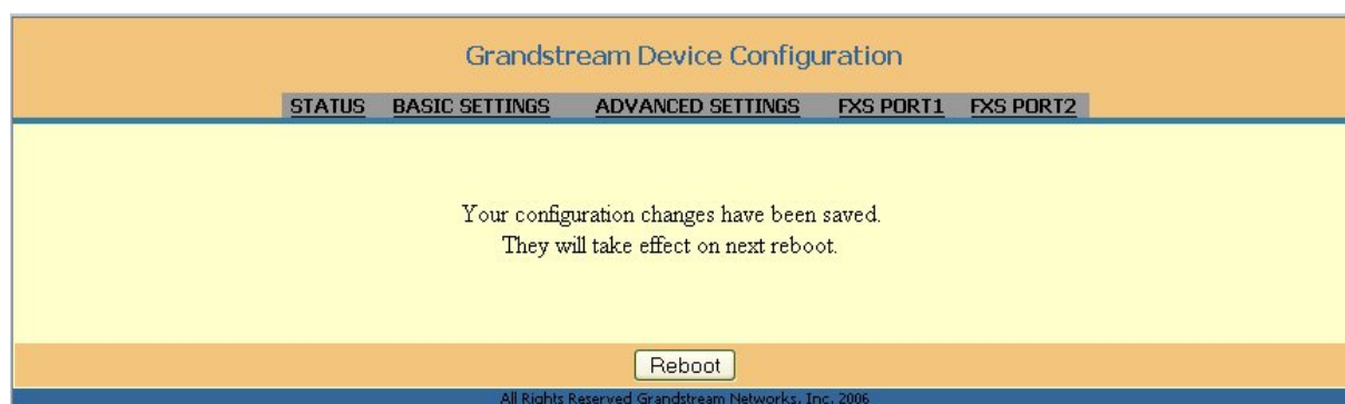
FIGURE 4: SCREENSHOT OF SAVE CONFIGURATION PAGE

Click the “Update” button in the Configuration page to save the changes to the HT-502 configuration. The following screen confirms that the changes are saved. Reboot or power cycle the HT-502 to make the changes take effect.