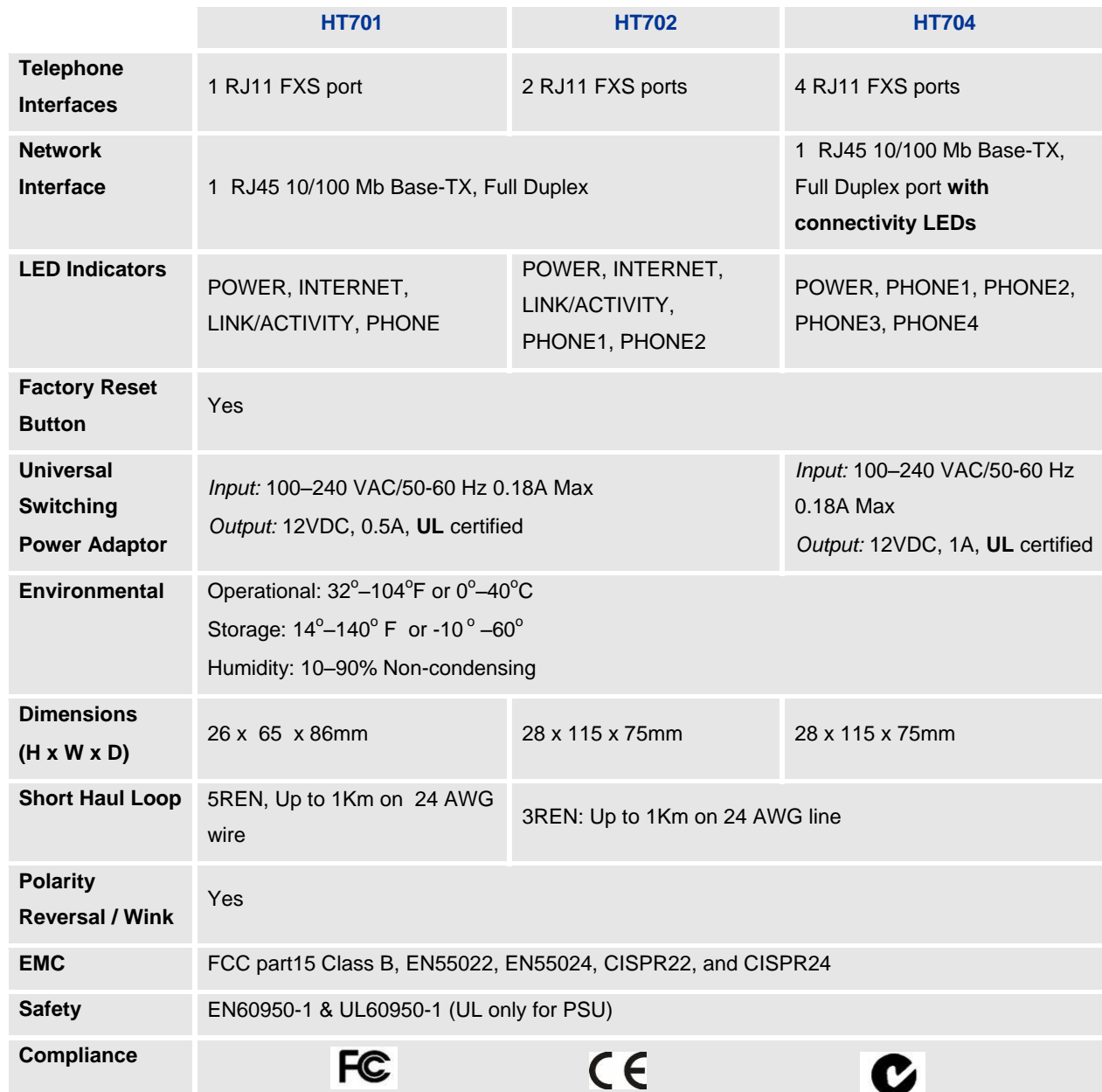
TABLE 5: HT70X HARDWARE AND TECHNICAL SPECIFICATIONS

The table below lists the Hardware and Technical specification of HT70X.