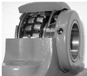
Roller bearing with set screw

When the application load and speed exceed the capacity of ball bearings, roller pillow block bearings are typically specified. Like ball bearings, roller bearings can carry a combination of radial and thrust loads; however, roller bearings, in order to operate properly, require a radial load at least equal to the thrust load. Insufficient radial loading allows the rollers to skid within the race, which could cause premature failure of the bearing components. Tapered roller bearings that are similar to the spherical rollers, are commonly specified for vertical applications where high thrust loads are encountered.