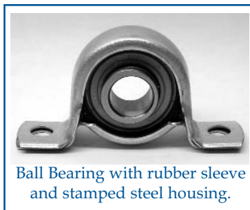
Ball Bearing with rubber sleeve and stamped steel housing.

Ball bearings with stamped steel housings are well suited for applications with very light loads and lower speeds. The main design characteristic that defines stamped bearings is the rubber sleeve around the bearing insert, which snaps into the stamped housing. The use of these bearings is limited to fan products with 3/4 inch and smaller diameter shafts, and one horsepower and smaller motors.