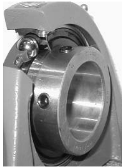
Ball bearing with set screw

The balance of the fan and ventilator products that exceed the limitations of the stamped steel bearings use the air handling ball bearing with the set screw locking method. This includes fans with a shaft diameter of one inch and larger, and a motor of 1 1/2 horsepower and larger. In applications with lower speeds the D-Lok mechanism is available, however, the D-Lok advantages are negligible and not cost justified.