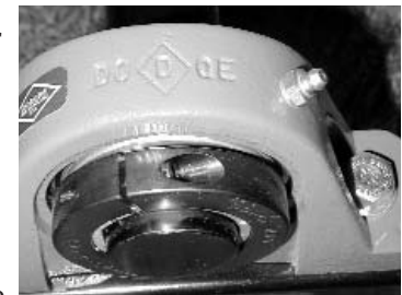
Ball bearing with D-Lok

Greenheck uses Dodge D-Lok ball bearings for all centrifugal, vane axial and industrial units within the ball bearing application range. In our fan and ventilation line, Dodge D-Lok ball bearings are