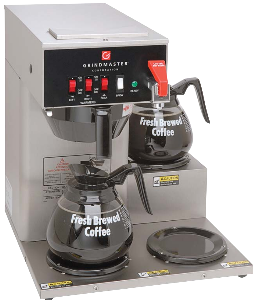
Model AT-3WR (decanters sold separately)