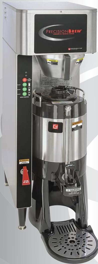
Model PBIC-330 Single Vacuum Insulated Shuttle® Brewer

PRECISION BREW™ Vacuum Insulated Shuttle® Brewers