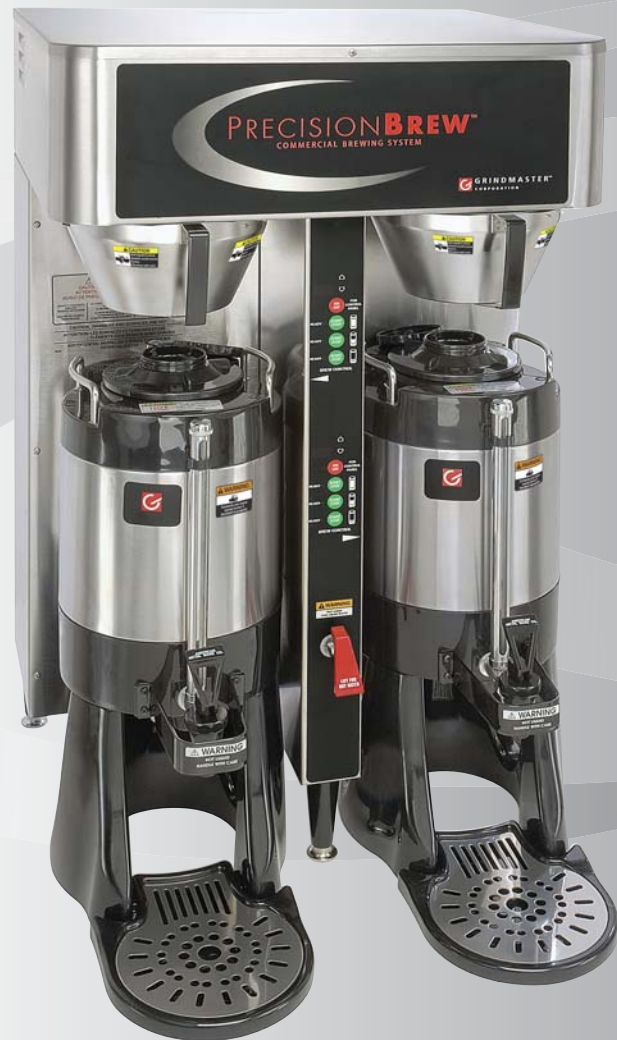
Model PBIC-430 Twin Vacuum Insulated Shuttle® Brewer