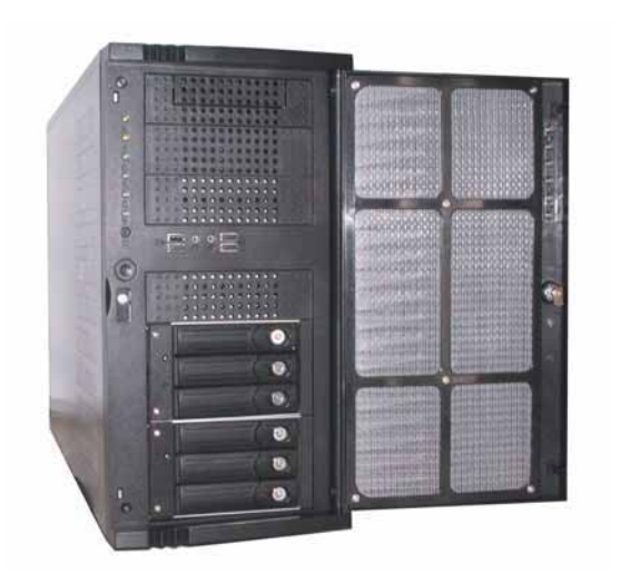
Type A+ SI-0357 x 1