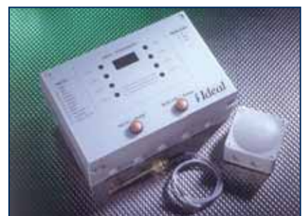
Sequencer control kit