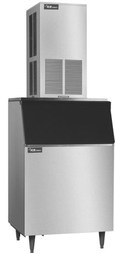
EMF 450 on a B55 Bin

ICE-O-Matic® is the Best ICE Making Solution for: Hard Water, Food Safety and Tight Spaces