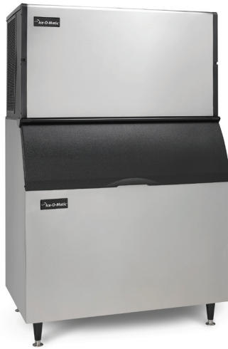
ICE2106 on B100