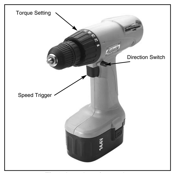
Fig 2. Location of controls.