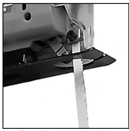
Fig 3. Jig saw blade installation.

Always cut to the outside of the pattern line. Push the saw evenly at a rate suitable for the material being cut. If the motor should begin to slow, ease up on the cutting pressure.