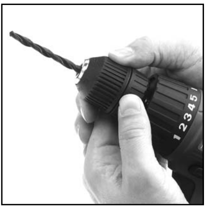
Fig 1. Inserting bits into the chuck.