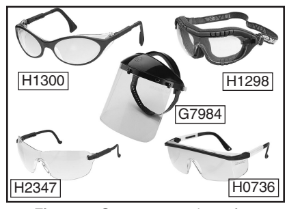
Figure 5. Our most popular safety glasses.

Safety Glasses are essential to every shop. If you already have a pair, buy extras for visitors or employees. You can't be too careful when it comes to shop safety!