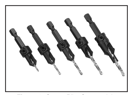
Figure 8. G2575 Pilot Countersink.

Screw holes may be drilled flush or counterbored using these quality hex shanked countersinks.