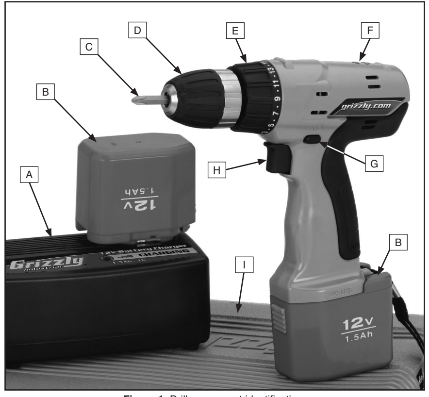
Figure 1. Drill component identification.