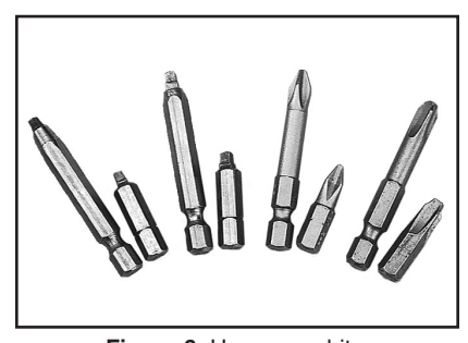
Figure 6. Hex power bits.

These hex shaft bits are available in 1" and 2" lengths , so they work directly in the chuck or in quick change bit holders.