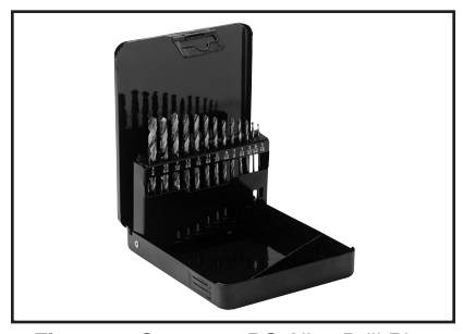
Figure 7. G8865 13-PC Alloy Drill Bits.

Cobalt Alloy bits will retain their edge sharpness longer than normal HSS bits, resulting in a significant saving of time and money in the workshop. Includes a heavygauge steel index case for storing. G8865: 1/16" - 1/4"; G8866: 1/16"- 3/8"; G8867: 1/16"- 1/2".