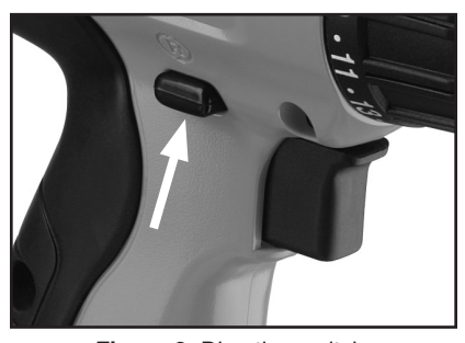
Figure 2. Direction switch.

To place the direction switch (Figure 2) in the lock (center) position, push the switch until it protrudes equally from both sides of the drill.